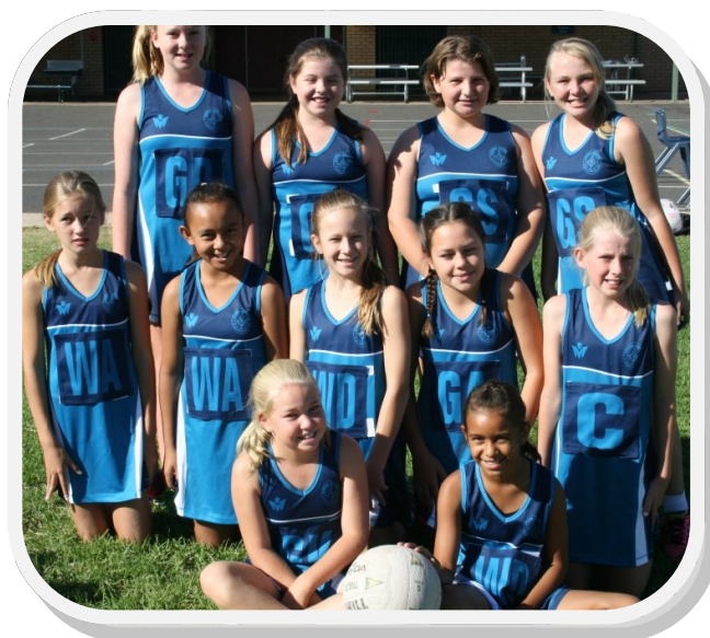
Knockout Netball - (above) Netball Team