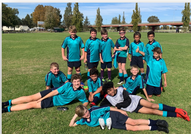
Girls and Boys Knockout Soccer Teams.