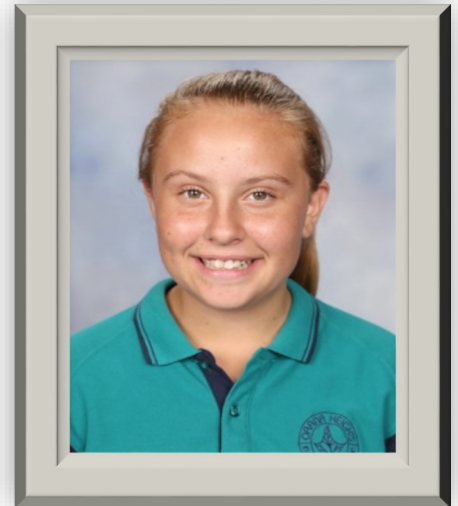
Athletics Carnival Pictures