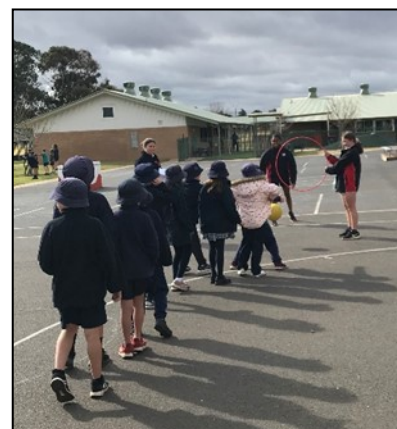
Dubbo College South Campus Year 9 elective Sports Studies class came to visit Orana Heights last week.

They had planned a coaching session for 2M and 2B students. Year 2 had such a great time warming up, practising their catching and throwing skills, playing modified basketball and netball and finally cooling down.