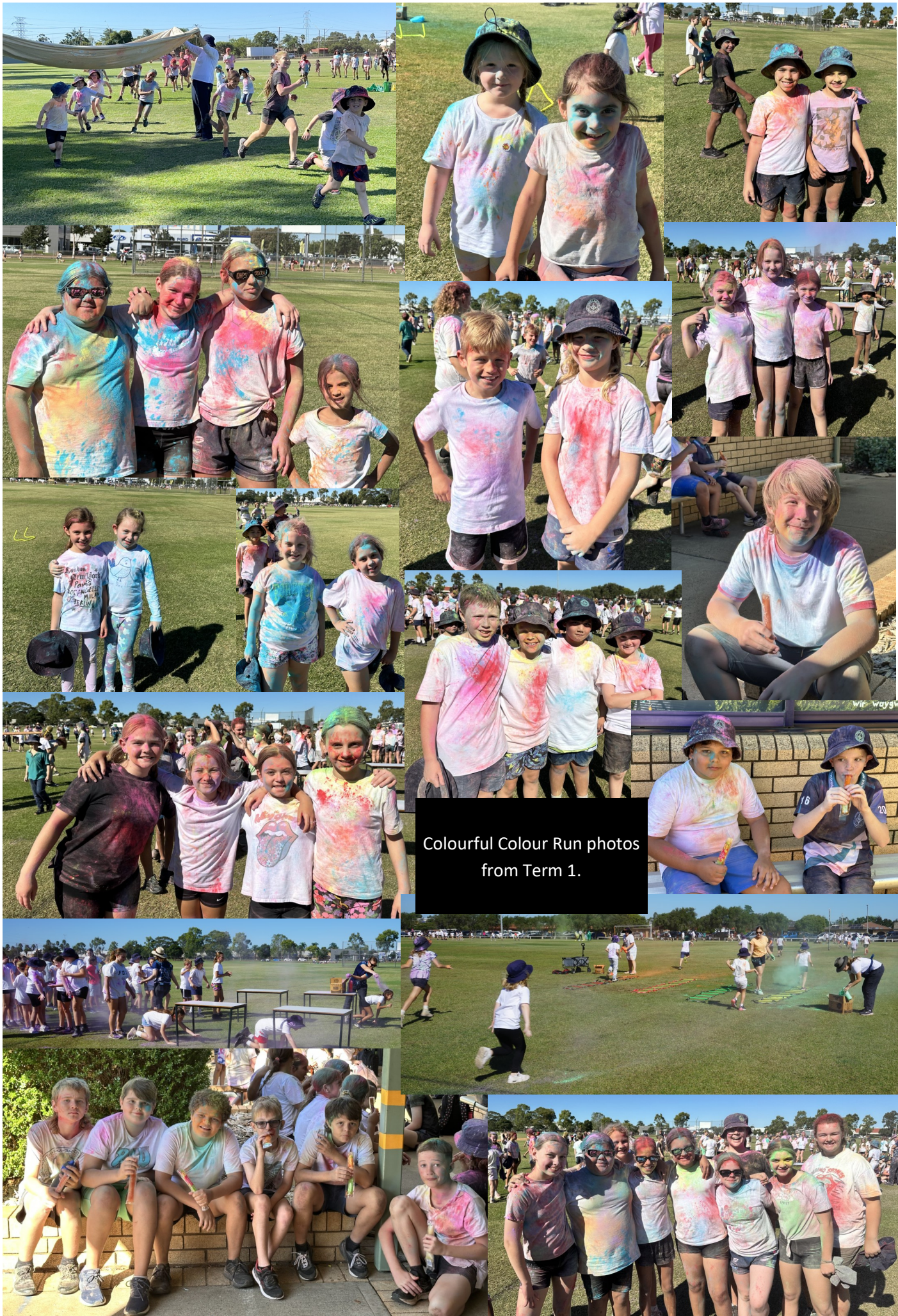
Colourful Colour Run photos from Term 1.