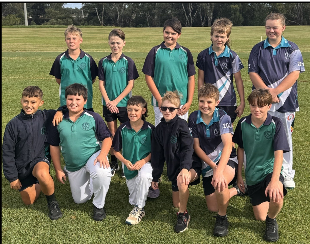
OHPS senior cricket team

Quote: "Being a mother is like being a gardener of souls. You tend your children, make sure the light always touches them." By Karen White (from Sea Change)