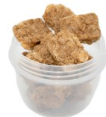
Wholegrain cereal bites