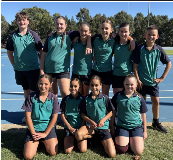
The knockout netball team following their win against Buninyong PS in Round 1 of the competition. Their next game is on May 27.

The Kinder students enjoy having someone special join them at school for this special time.