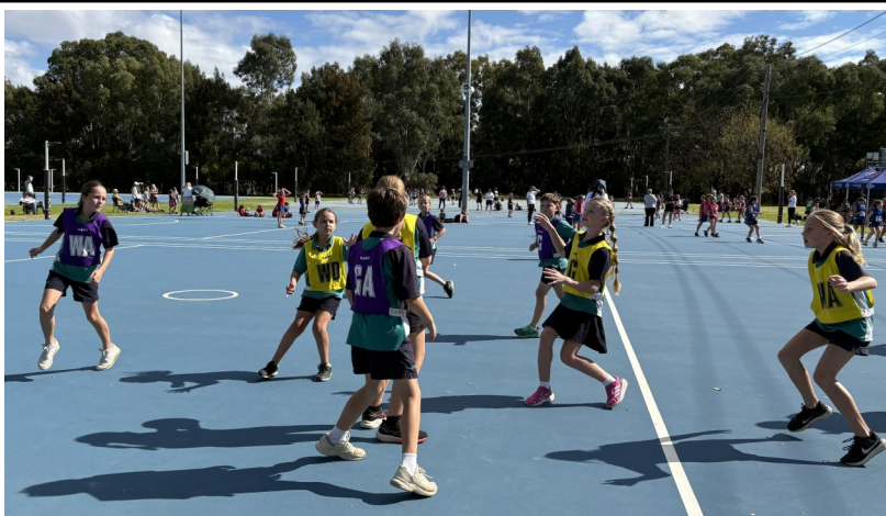
On Monday, 40 students enjoyed a fun skill building day of netball. The NSW Netball Schools Cup encourages students to 'have-a go' in a supportive environment.