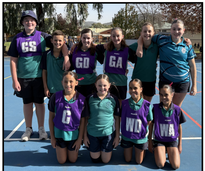
KO netball team following their win against Wellington PS last week.