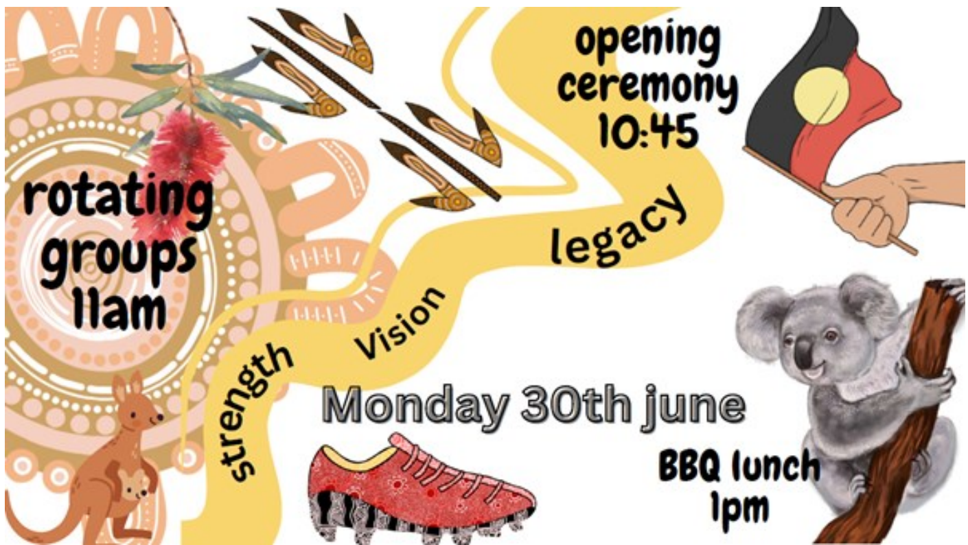
This NAIDOC poster was designed by Willow Betcke.